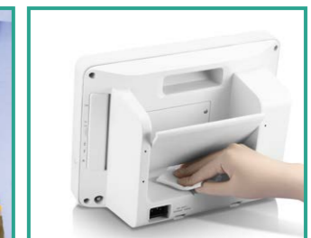
Compatible with multiple cleaning agents