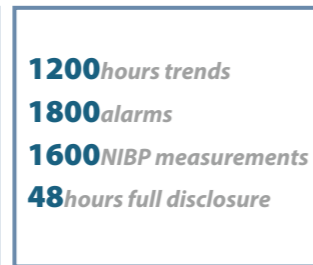
Huge data capacity