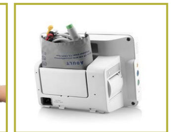
Unique accessory cabinet